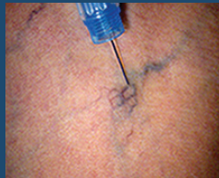
Sub-surface view USING SYRIS