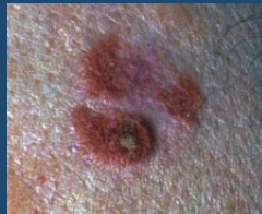
Surface view without Syris