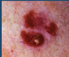
Sub-surface view USING SYRIS