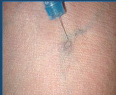
Surface view without Syris